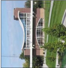
The newest addition to the Canal area, the Claren monorail station, sets a modern precedent for future development.

The re-development of the former Buggs Temple will provide a premium ice cream stand, nationally known coffee shop, and casual dining making Buggs a destination along the Indianapolis Central Canal.