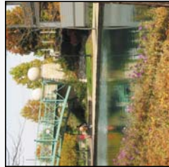
The Canal Walk features some of Downtown Indianapolis' most vibrant and expressive pedestrian features.