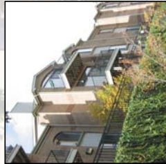
Canal Walk condominiums provide the constant pedestrian density required to create this dynamic urban fabric.