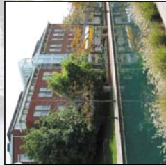
Organizations like the Historic Landmarks Foundation and the Indiana Architectural Foundation provide solid anchor points along the Canal Walk.